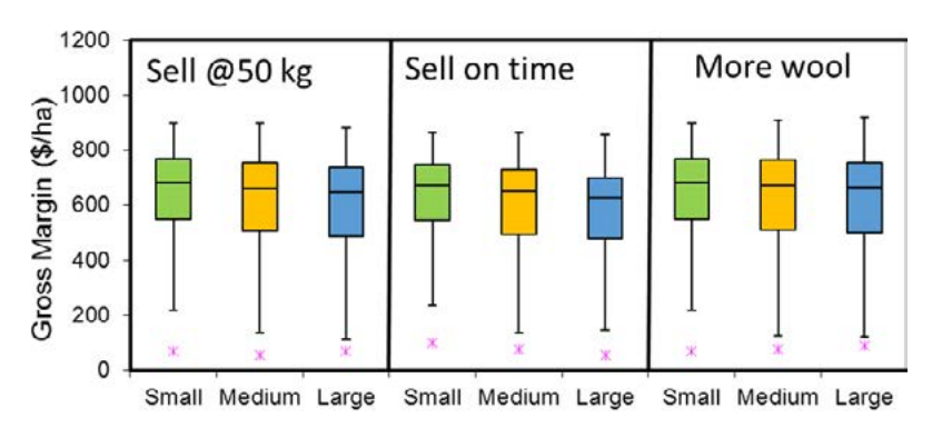
Figure 1. Box plots showing the gross margin of each combination of the frame size and production systems. An asterix denotes an outlier – defined as greater than 1.5 times the interquartile range.